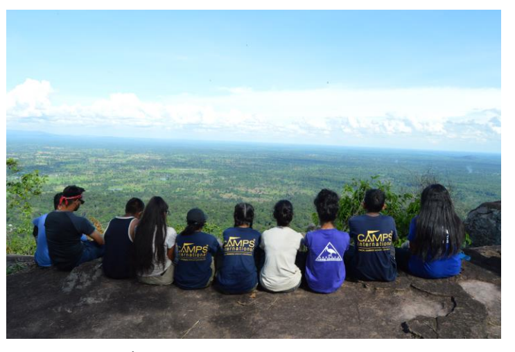
6<sup>th</sup> Form students in Cambodia 2016