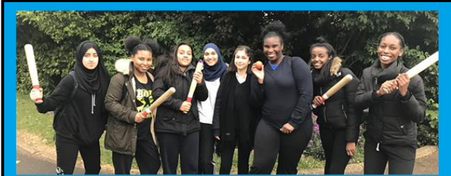
Brent Senior Rounders Champions!