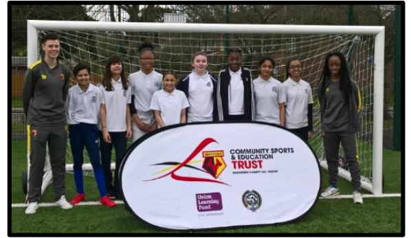
Rewards and Recognition