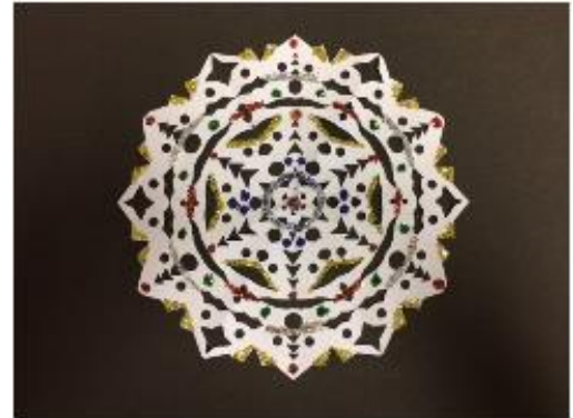
Rewards and Recognition